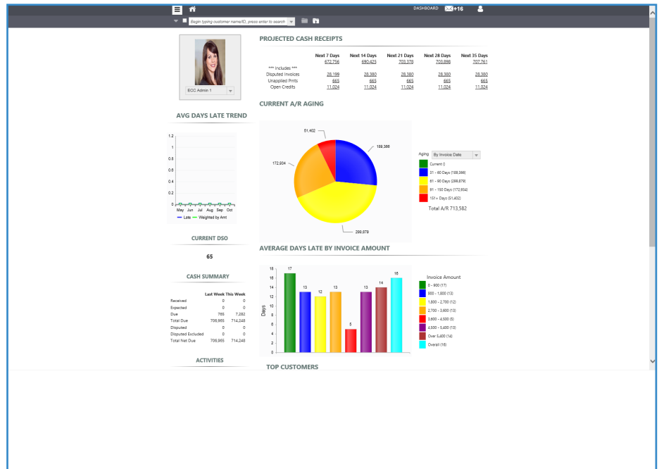
Figure 10.1 Credit and Collections—Improve cash flow and reduce receivables balances.

CRE combined with the Epicor Payment Gateway stores all of the credit card data encrypted securely in the cloud, therefore the Payment Card Industry Data Security Standard (PCI DSS) scope for Epicor ERP users is reduced.